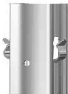
Moving wire area