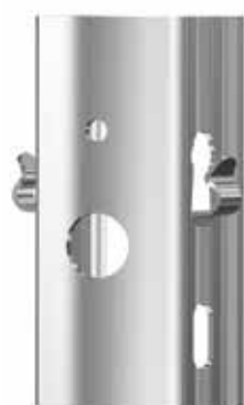
Upper fixed wire area