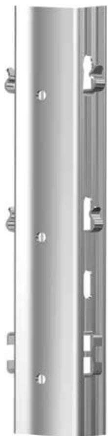
Lower fixed wire area